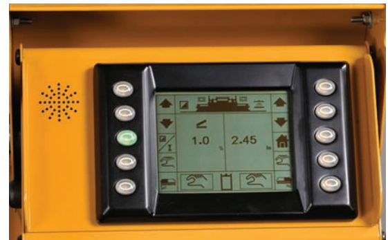
Cat Grade and Slope Control